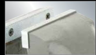
HARDENED STEEL JAWS

• Meets federal spec # GGG-V-410a, Type VI, Class 2