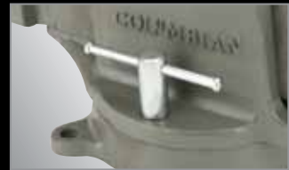
INDUSTRIAL 360° LOCKING SWIVEL BASE