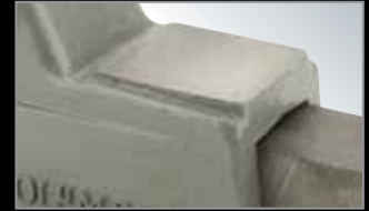
LARGE POLISHED ANVIL